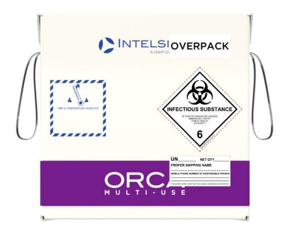
Correctly Labelled Category A ORCA Multi-Use Overpack